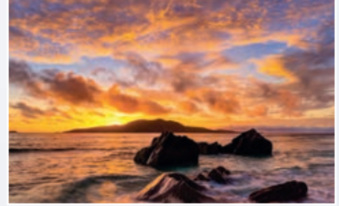
La Digue, Seychelles, Indian Ocean. The Seychelles is one of the world's smallest countries, composed of two main island groups: the Mahé group of more than 40 central, mountainous islands; and a second group of more than 70 outer, flat, coral islands. Of the roughly 200 plant species found in the Seychelles, some 80 are unique to the islands – the most famous of these being the Coco de Mer, which is found on only two islands.