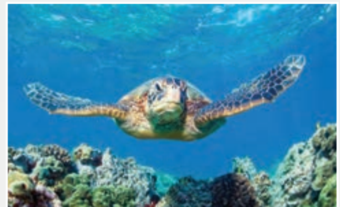
Green Sea Turtle. The Green Sea Turtle is one of the largest sea turtles and the only herbivore among the different species. They are, in fact, named for the greenish colour of their cartilage and fat, not their shells. Green Sea Turtles are found mainly in tropical and subtropical waters. Like other sea turtles, they migrate long distances between feeding grounds and the beaches from where they hatched.