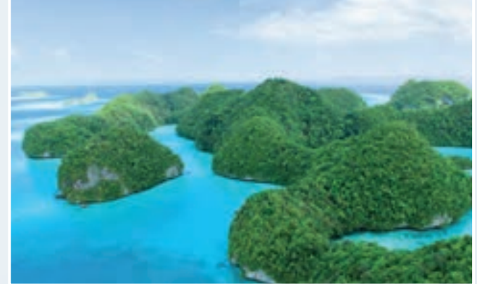
Palau Islands. Palau is a country in the western Pacific Ocean. It consists of some 340 coral and volcanic islands perched on the Kyushu-Palau Ridge. Palau has more species of marine life than any other area of similar size in the world. Corals, fish, snails, clams, sea cucumbers, starfish, sea urchins, sea anemones, jellyfish, squid and feather-duster worms exist in profusion and variety.