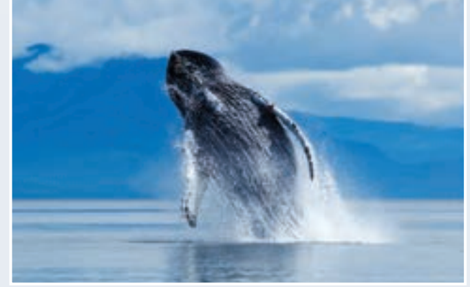
Humpback Whales. Found in oceans and seas around the world, Humpback Whales can migrate up to 15,500 miles (25,000km) each year. They feed only in summer, in polar waters, and migrate to tropical or sub-tropical waters to breed and give birth in the winter. The species' diet consists mostly of krill and small fish. Humpbacks have a diverse repertoire of feeding methods, including the bubble-net feeding technique.

Inset Picture: A Breaching Humpback Whale.