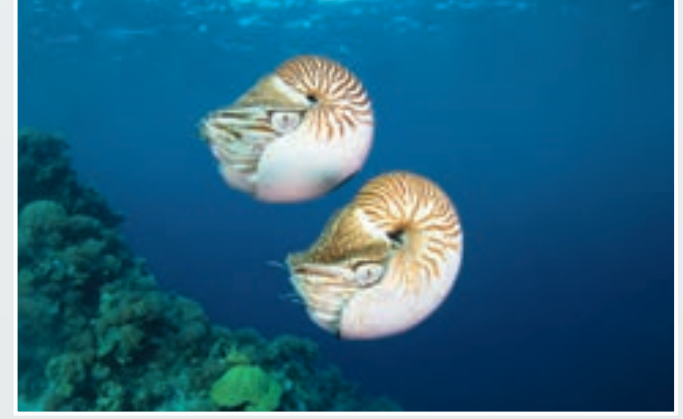
Nautilus. A native of the tropical Pacific, the Nautilus is a distant cousin to the Octopus and Squid. It has more than 90 tentacles – the most of any cephalopod – that it uses to feel along reefs for food. To avoid predators by day, they dive down to reef slopes as deep as 2,200ft (700m). A Nautilus uses a hood like a trap door to seal itself inside its shell for protection. At night, they migrate up to shallower depths of about 230ft (70m) to feed.