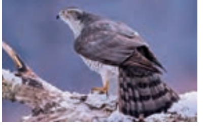
A silent wintry scene in beautiful unspoilt woodland near Ripon. This small city on the edge of the Dales has a magnificent 7th century cathedral, medieval streets with small alleys, many fascinating historic buildings and a fine Georgian marketplace. The goshawk, a powerful and rather fierce-looking raptor with a prominent brow, is found in these forested areas.