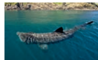
Facing the Atlantic on the eastern side of St Ives Bay, the exposed beach at Godrevy is popular with surfers. Godrevy Lighthouse is set on an island just off the coast, made famous by Virginia Woolf's 'To The Lighthouse'. The headlands and coves are rich in wildlife. Commonly seen in summer off the Cornish coast, basking sharks are the second largest fish in our oceans.